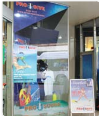
LAMINATED POSTER / WINDOW STICKER It's vital to have good street presence