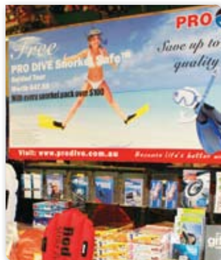
VINYL GRADE B BANNER / KEDAR ROPE Big scale advertising = Big Impact