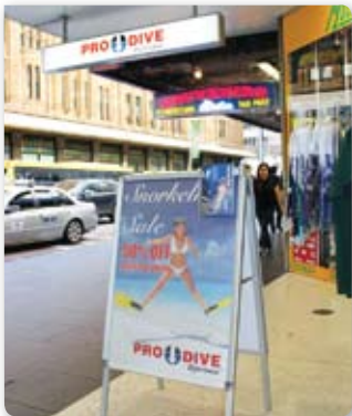
SNAP AFRAME Direct your customers to you!