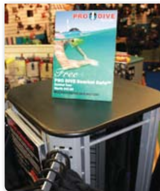
2MM COUNTER CARD WITH STRUT Place signs in high traffic areas