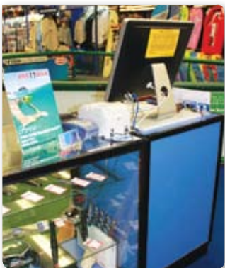
2MM COUNTER CARD WITH STRUT Counter cards get noticed at registers