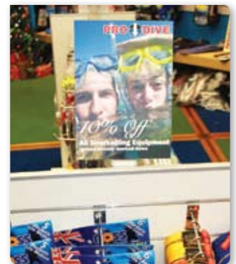
Posters are simple and they work! Place them near your products

APPLY TODAY CALL US NOW 1300 69 22 66 for our special onseller discount!