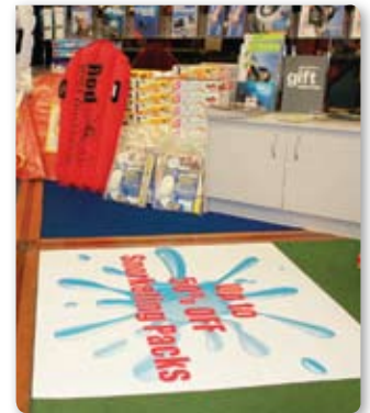
FLOOR STICKER Doesn't take up space plus hard to miss!