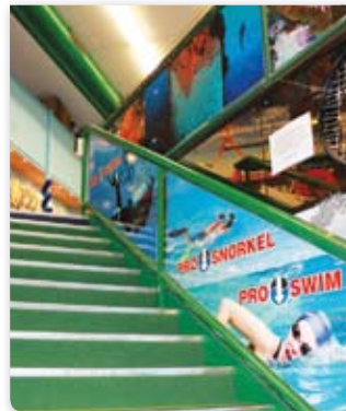
GLOSS MONOMERIC STICKER Take advantage of your stairs to brand your business