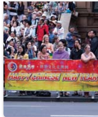
Vinyl Banners to promote the event