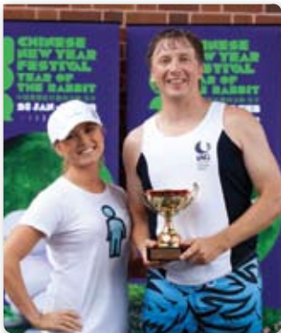
Pull Up Banners for award ceremony