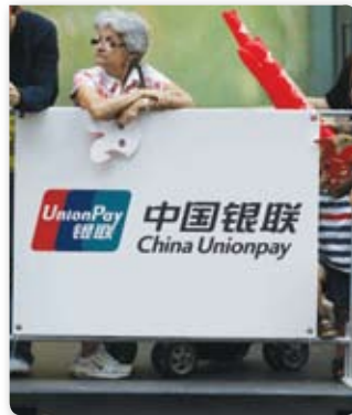
Corflute street signage for sponsors