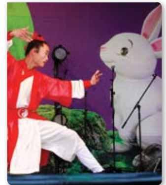
Fabric Backdrop for performances